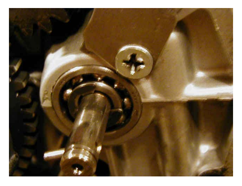
After replacing the screw, there is plenty of space for the collar.