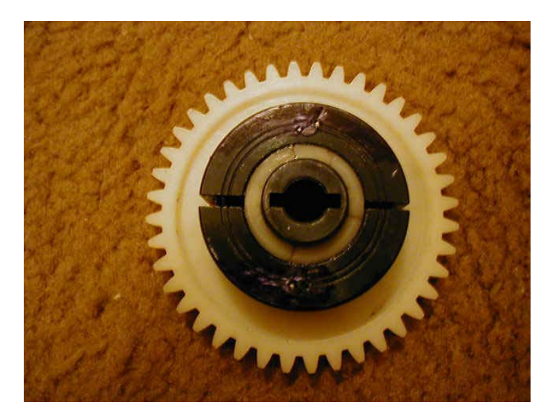
Back (you will notice that I ground off the screw flush with the back and lock-tited all screws)